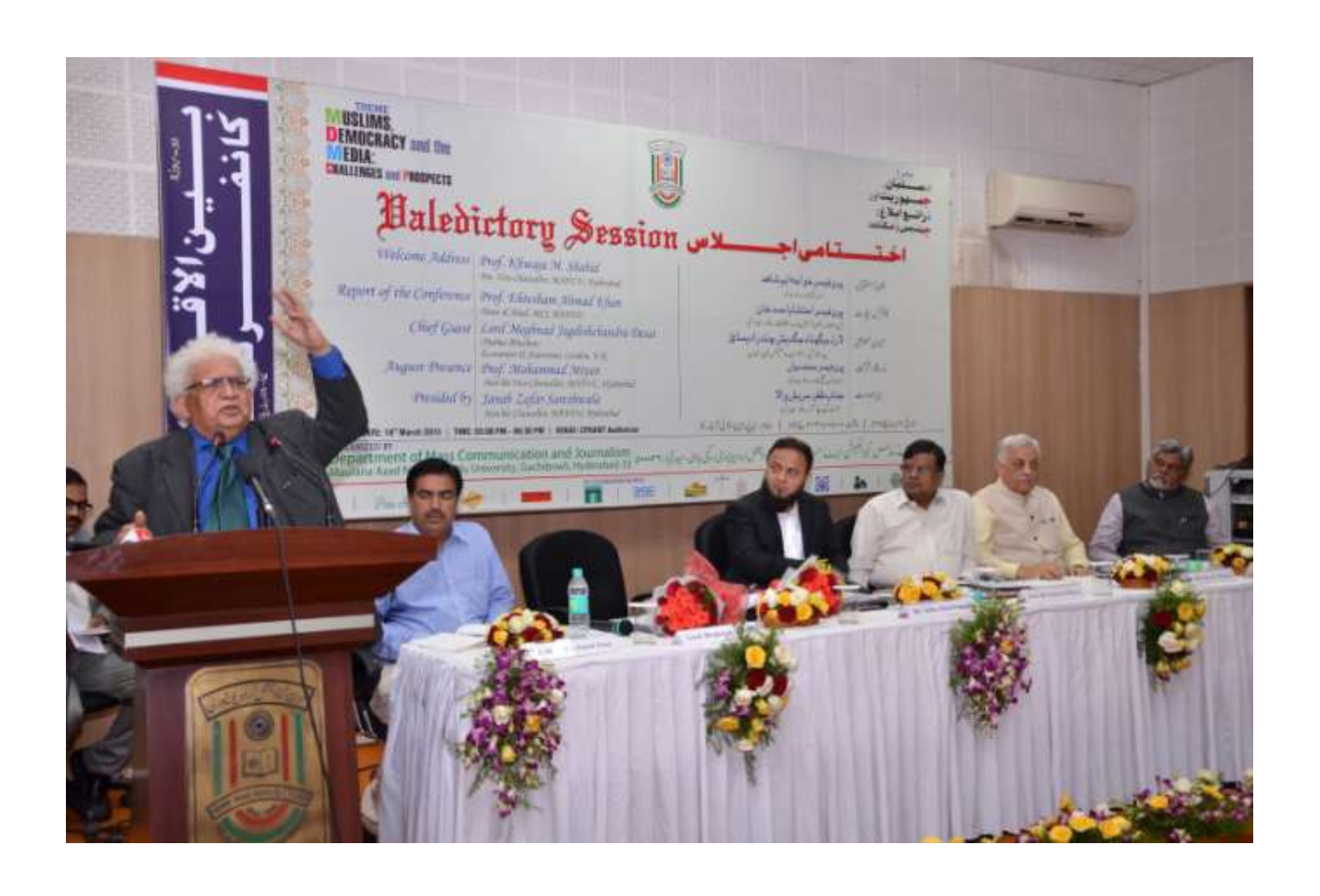
Head Department of Mass Communication & Journalism